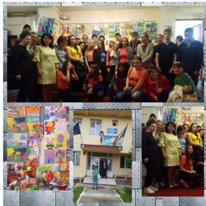
Festivalul Internațional Flori de Mai