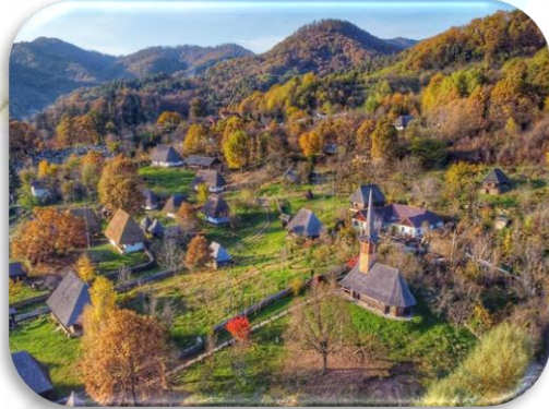
Baia Mare Village Museum

This extraordinary photo of the Baia Mare Village Museum, representative of the authentic and traditional Maramures village, was selected and included in the Album with the most beautiful photos of European regions and cities, published on the CoR Europe Day 2021 website: